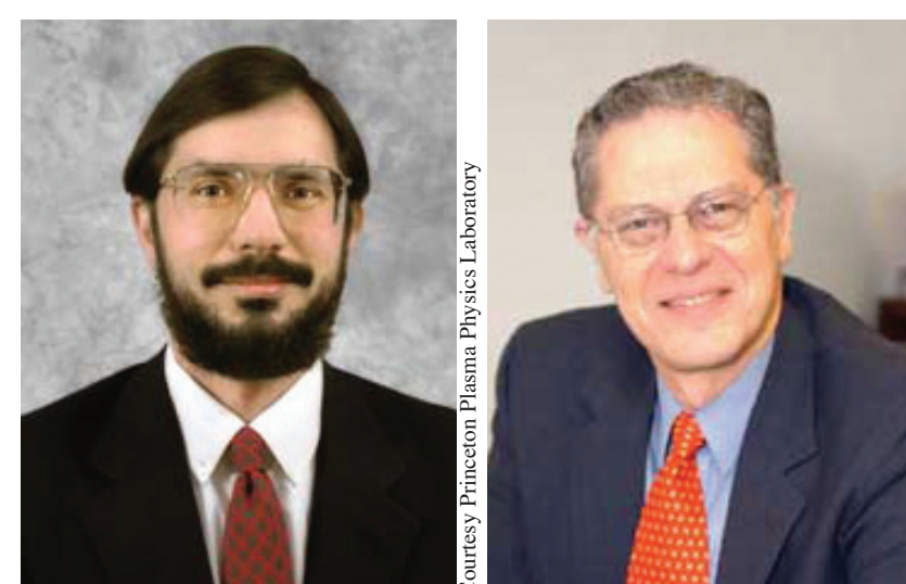
Russell A. Hulse and Joseph H. Taylor, both of Princeton University, shared the 1993 Nobel Prize in Physics for their discovery of evidence of gravitational waves, confirming the prediction by Einstein in 1916.

The pulsars won't be colliding any time soon. Although each neutron star is 7 miles in diameter and 1.4 times the mass of the Sun, they are still about a million miles apart. At their present rate, it will take 300 million years for the stars to merge.