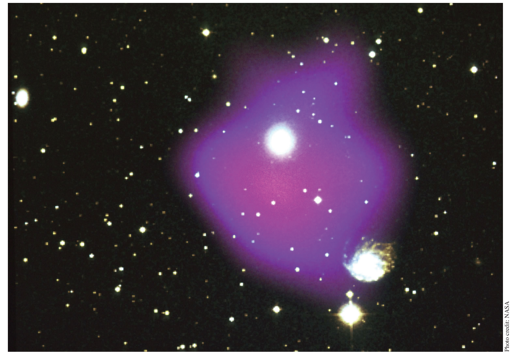
Hot X-ray emitting gas (shown in purple) was discovered by the ROSAT satellite to be present in this group of galaxies. The presence of the gas provides evidence for the existence of dark matter.

An earlier case for the existence of dark matter was that made by astronomer Vera Rubin in 1970. She studied the rotation rate of stars in the Andromeda galaxy and found that it just didn't make sense. The stars in the disc further from the galactic center were not rotating more slowly than those closer in, as models predicted they